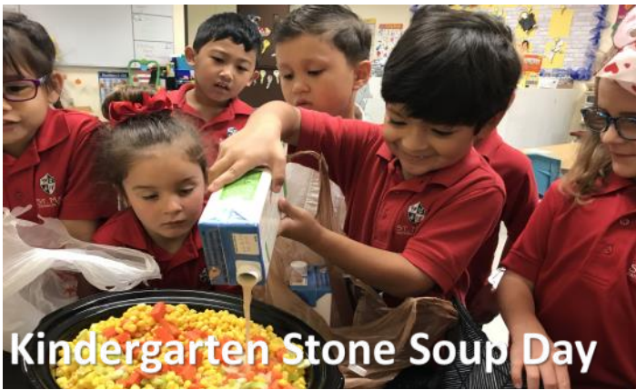
Kindergarten Stone Soup Day